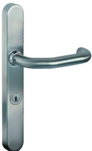
Kaba TouchGo Door furniture

The highest priority of any master key system is security. The same is true for the Kaba TouchGo but to a higher degree, because any access medium that is lost can be revoked quickly. This avoids both security gaps as well as the cost-intensive replacement of an entire master key system. Along with the new convenience, this is another important advantage of the electronic access system.