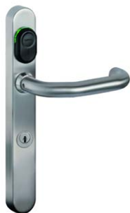
Kaba c-lever with TouchGo function

The perfect combination for offices: RFID, CardLink and Kaba TouchGo. Kaba c-lever with TouchGo combines the advantages of a professional management system with greatest convenience for the user. This is because the electronic door furniture can be completely integrated into the Kaba RFID world and even into the CardLink concept for online solutions. Master key systems can be administered by using the Kaba evolo manager or the Kaba exos 9300 software, and your working colleagues have their hands free for other important things.