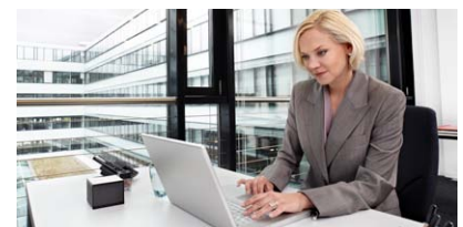
Maximum investment protection thanks to easy-to-program authorization media.

Even here, there is nothing left to be desired, because Kaba c-lever with the Kaba TouchGo function can be seamlessly integrated into the existing Kaba security concept. Your system remains as secure as it was before: Kaba TouchGo is a convenience option that does not affect your security concept, but does ensure the highest investment protection.