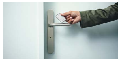
Fast and easy programming through the door lever.